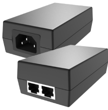
48 V 802.3 af PoE with grounding and lightning protection