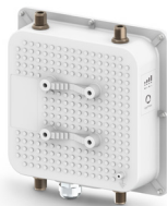
NFT 2AC outdoor unit