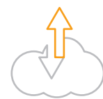
Online storage for saved calculations