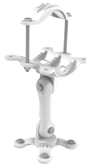
Professional mounting kit