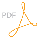
Downloadable PDF reports