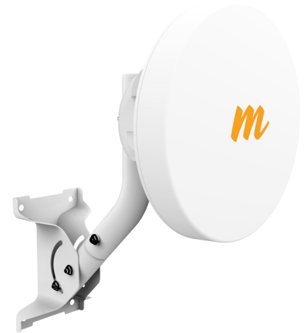
C5 with Mount