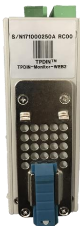
TPDIN® DIN Rail Attachment